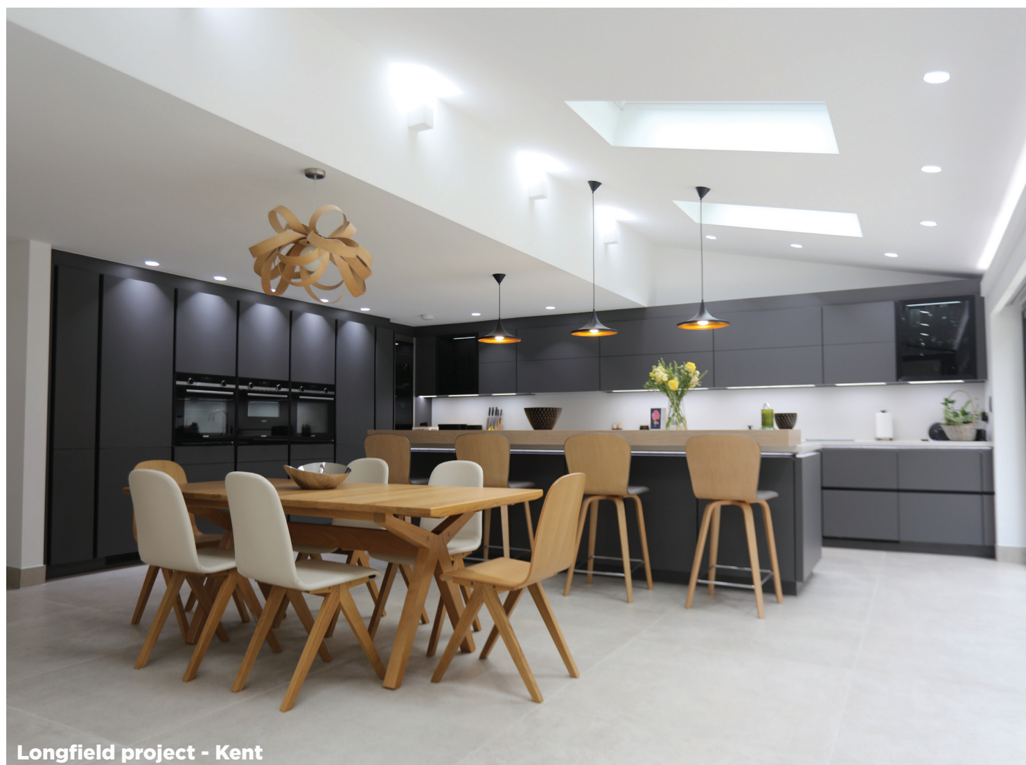
Longfield project - Kent