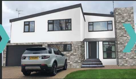
MOCK IMAGE SUPPLIED