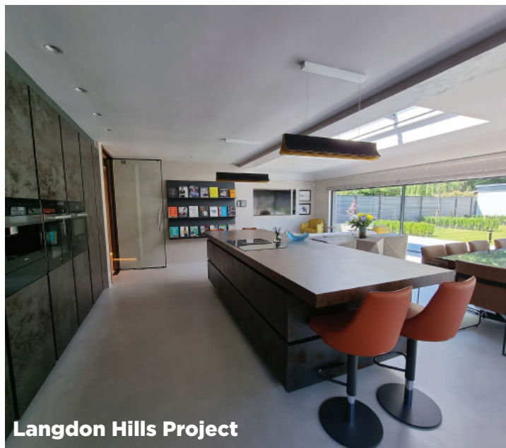
Langdon Hills Project