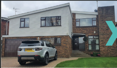
CLIENT'S ORIGINAL PROPERTY

We have a great portfolio of external renovation projects we have worked on; We supply our clients with a start-to-finish package, from designing the desired look in-house, which allows our clients to visualise what the project will look like finished before any financial commitment, to our in-house team which tackles every aspect of what an external renovation can include, for example, we can supply and install windows, doors, natural stone cladding, weatherboard cladding, resin and block paved driveways, landscaping, soffits and fascias and much more - we have everything covered.